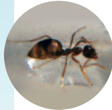
odorous house ant